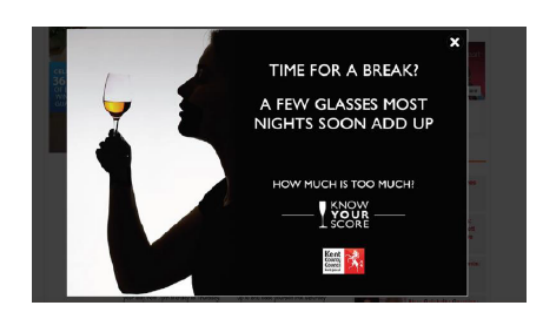
Global - Overlay - 2.05% CTR

Do you know your score? Alcohol could be a problem kent gov ukknowyourscore Take our quiz to see how much your alcohol consumption could be affecting you. Google Search — 2.87% CTR