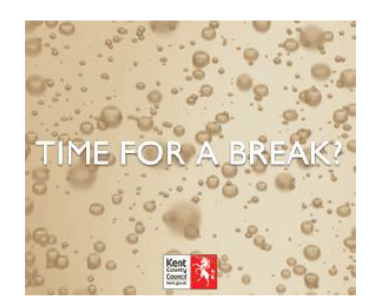
Google Display - Prosecco - 1.05% CTR

Do you know your score? Alcohol could be a problem kent gov ukknowyourscore Take our quiz to see how much your alcohol consumption could be affecting you. Google Search — 2.87% CTR